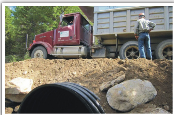
6. Place rip rap as required and start using the crossing immediately.