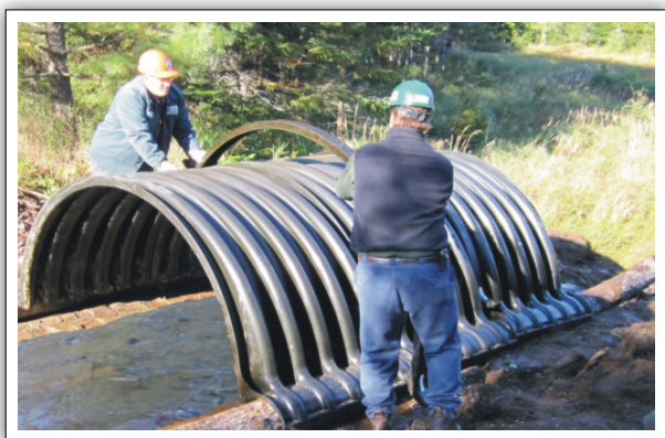
3. Slide the connectors over the adjacent module flanges.