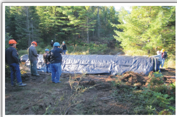
4. Cover the assembled Enviro-Span with geotextile.