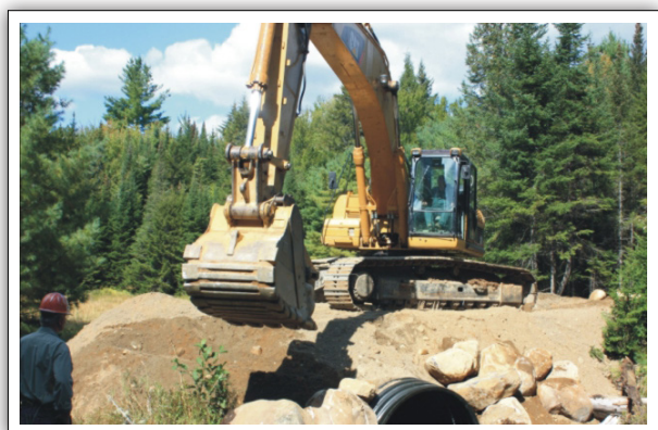
5. Build up backfill on both sides, compacting the native material with the excavator bucket. Cross over as soon as minimum fill cover is achieved.